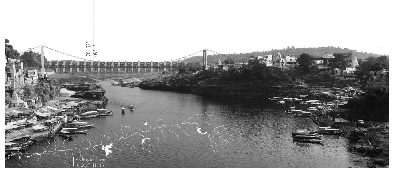
Figure 3. View of Omkareshwar from the bridge, with the massive dam vigilant, defying the modest presence of the temples and the ghats.

environmental and rehabilitation compliance.<sup>2</sup> The Narmada Water Disputes Tribunal (NWDT) was constituted in 1969 to manage inter-state disputes on the benefits of water and energy shares.