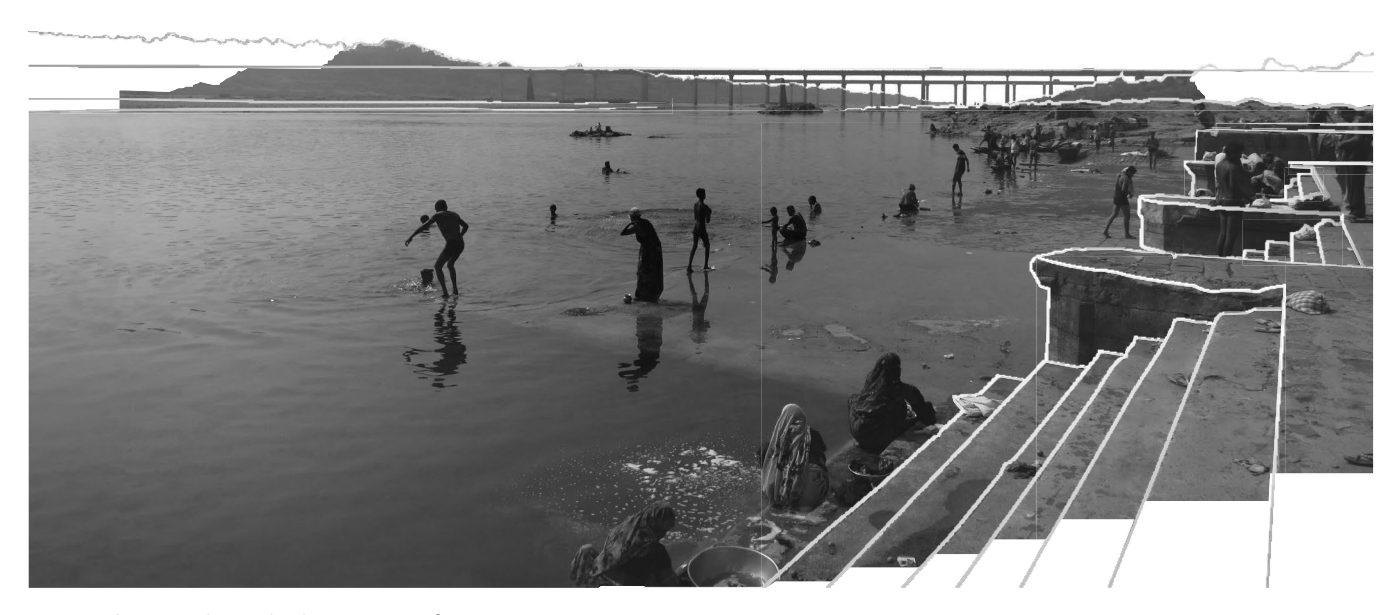
Figure 5. The Narmada river landscapes in transformation.

construction, NBA pointed out deficiencies in the State Government's implementation of its Resettlement and Rehabilitation provisions. They claimed that the Narmada Hydroelectric Development Corporation (NHDC)—the corporation in charge of the works—should not be allowed to raise the reservoir-level until affected villagers were resettled. In 2007, the High Court considered the petition. However, the NHDC and the State government appealed to the Supreme Court of India, and were finally approved to proceed.