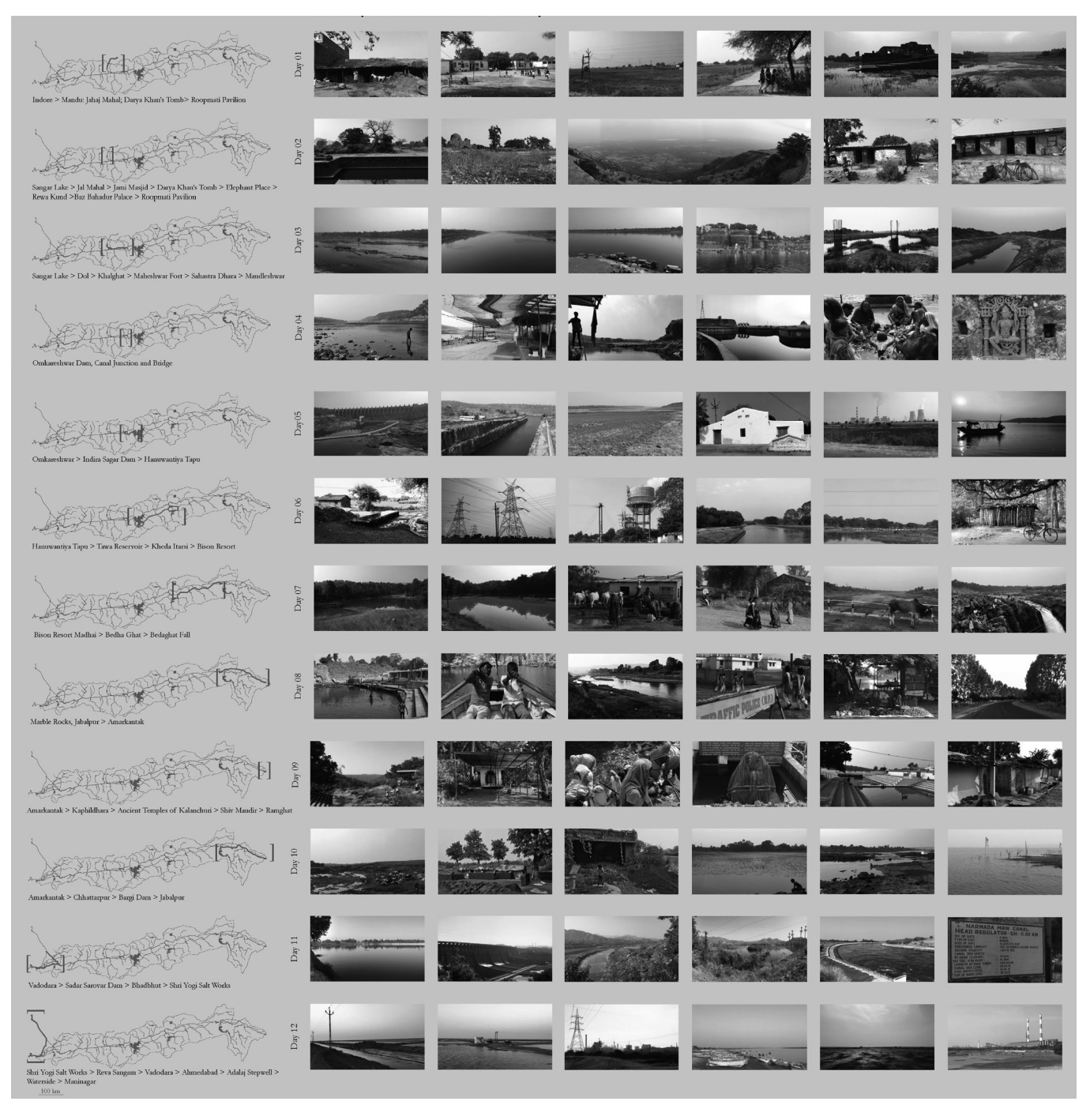
Figure 1. The field trip along the Narmada River Valley took place during November 2017. The first part of the trip started in Indore and took us to the birth of the river, in Amarkantak, and then back to Jabalpur. The second part started in Vadodara towards the Narmada River Delta and back to Ahmedabad.

imposed notions of prosperity and the local resistance that protects the certain, intangible values of the Narmada.