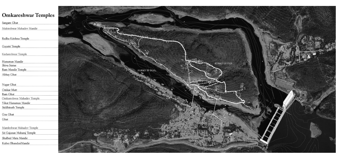
Figure 4. Aerial view highlighting the location of the temples and the parikrama route at Omkareshwar .

punctuate the sacred landscape in front of the dam beyond, ringing ephemeral bell sounds and worship songs throughout the historic city. Omkareshwar is an important destination in the Narmada Parikrama. Pilgrims visit the many temples that are situated throughout the hilly topography of the city, and encounter the Narmada holy waters within the many ghats and at the Sangam, the sacred river's confluence. As pilgrims engage in bathing rituals with decreasing water levels, the daunting presence of the Omkareshwar Dam hides behind a large reservoir that submerged many villages and sacred sites in its making.